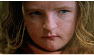
HEREDITARY FROM FRI. 29TH JUNE

DIRECTOR: Rupert Everett DETAILS: DE/BE/UK, 2018, 105mins, 15 STARRING: Rupert Everett, Colin Firth, Emily Watson