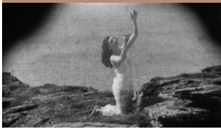
ARCADIA THU. 21ST JUNE - 8.45PM