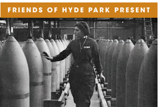
ASUNDER + DIRECTOR Q&A SUN. 03RD JUNE - 3.00PM

DIRECTOR: Michel Hazanavicius DETAILS: FR, 2017, 107mins, 15 STARRING: Louis Garrel, Stacy Martin, Bérénice Bejo