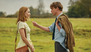
ON CHESIL BEACH FROM FRI. 01ST JUNE