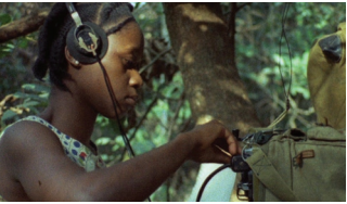
CONCERNING VIOLENCE MON 18TH JUNE - 8.10PM

DIRECTOR: Lucrecia Martel DETAILS: AR/BR/ES, 2017, 115mins, 12A STARRING: Daniel Gimenez Cacho LANGUAGE: Spanish with English subs