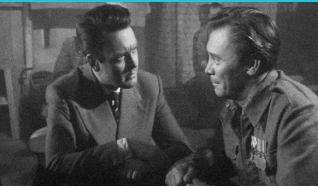
TIGER IN THE SMOKE TUE. 12TH JUNE - 6.30PM

DIRECTOR: Mai Zetterling DETAILS: SW, 1968, 100mins, 15 LANGUAGE: Swedish with English subs ASSOCIATION: Film Fringe, Club Des Femmes, Radical Film Network