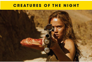
REVENGE SAT. 09TH JUNE - 10.30PM

DIRECTOR: Dominic Cooke DETAILS: UK, 2017, 110mins, 15 STARRING: Saoirse Ronan, Billy Howle, Emily Watson