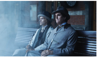
THE HAPPY PRINCE FROM FRI. 29TH JUNE

DIRECTOR: François Ozon DETAILS: FR/BE, 2017, 107mins, 18 STARRING: Marine Vauth, Jérémie Renier, LANGUAGE: French with English subs