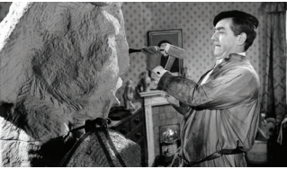
THE REBEL SAT. 16TH JUNE - 2.45PM

DIRECTOR: Victor Fleming DETAILS: 1939, US, 112mins, U TICKETS: Free – no need to book! ASSOCIATION: Transport support available via OWLS - call 0113 369 7077