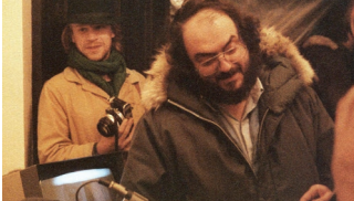
FILMWORKER FRI. 01ST JUNE - 8.45PM SUN. 03RD JUNE - 8.15PM

DIRECTOR: Coralie Forgeat DETAILS: FR, 2017, 108mins, 18 STARRING: Matilda Anna Ingrid Lutz LANGUAGE: French with English subs