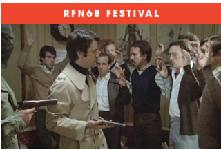
SEVEN DAYS IN JANUARY MONDAY 28TH MAY - 1.50PM