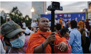
A CAMBODIAN SPRING + DIRECTOR Q&A SUN. 10TH JUNE - 5.00PM