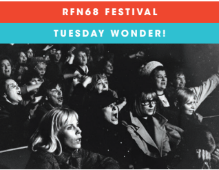
THE GIRLS (FLICKORNA) + SHORT TUE. 05TH JUNE - 6.30PM

To receive listings directly into your inbox, subscribe to our weekly listings email via our website.