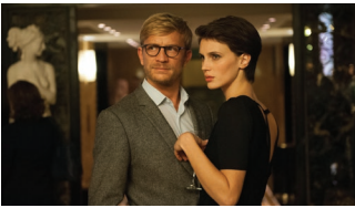
L'AMANT DOUBLE FROM FRI. 22ND JUNE

DIRECTOR: Fatih Akin DETAILS: DE, 2017, 106mins, 18 STARRING: Diane Kruger LANGUAGE: German with English subs