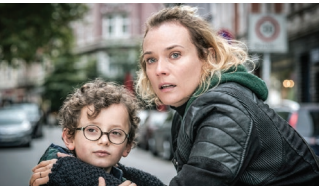
IN THE FADE FROM FRI. 22ND JUNE