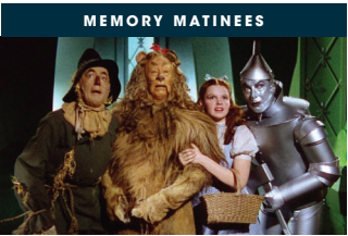
THE WIZARD OF OZ MON. 11TH JUNE - 2.00PM (DOORS: 1.30PM)