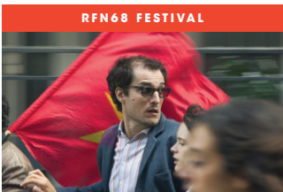
REDOUBTABLE SAT. 02ND JUNE - 6.00PM WED. 06TH JUNE - 8.30PM