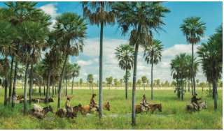
ZAMA SUN. 17TH JUNE - 1.30PM WED. 20TH JUNE - 6.00PM

DIRECTOR: Stanley Kubrick DETAILS: UK/US, 1968, U STARRING: William Sylvester, Keir Dullea, Douglas Rain